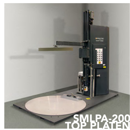
SMLPA-200 TOP PLATEN