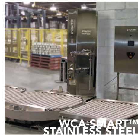
WCA-SMART™ STAINLESS STEEL