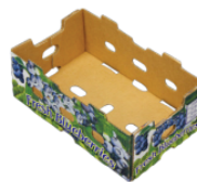
4 Corner Tray