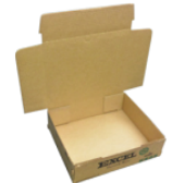
4 Corner Tray with One Piece Lid Tuck-in