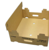
4 Corner Tray with Snap Lock Lid