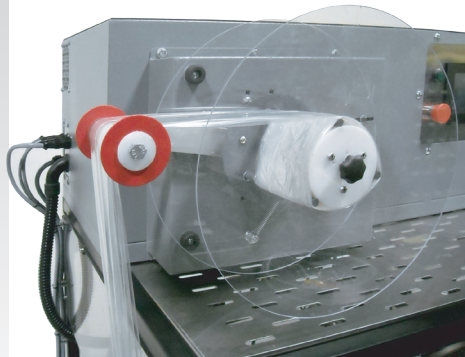
Easy Access Film Scrap Wind-up

Seal Bar Dimensions: 20"W x 24" L x 9"H Minimum Package: 2"W x 3" L x ¼"H Maximum Package: 17"W x 20" L x 8" (consult factory) Maximum Film Roll: 26" Centerfold