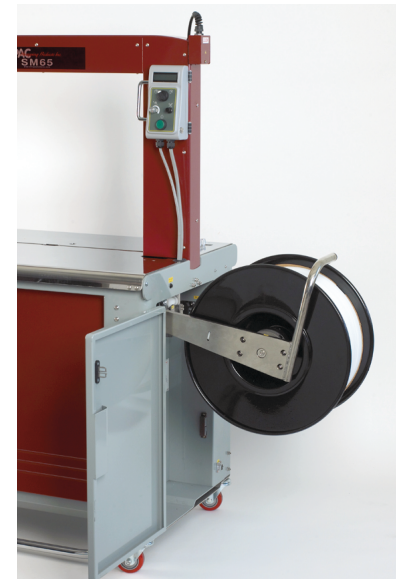
Easy coil loading system (5, 6 and 9mm units)