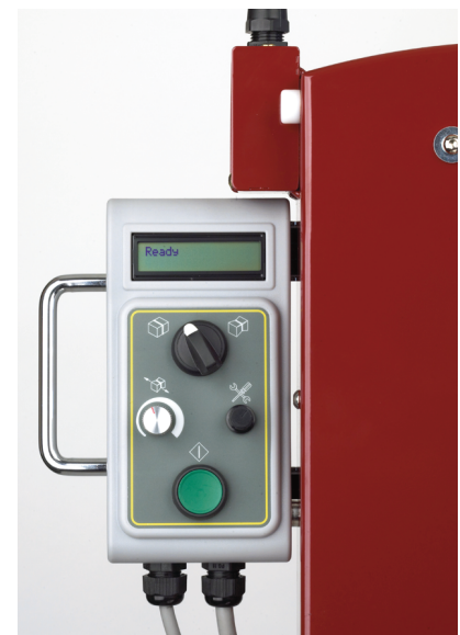
Pivoting Control Panel