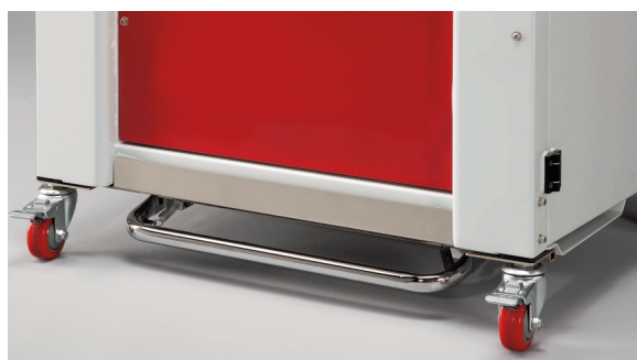
Foot bar activation