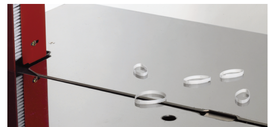
Jam free technology

(technical specifications continued on reverse side)