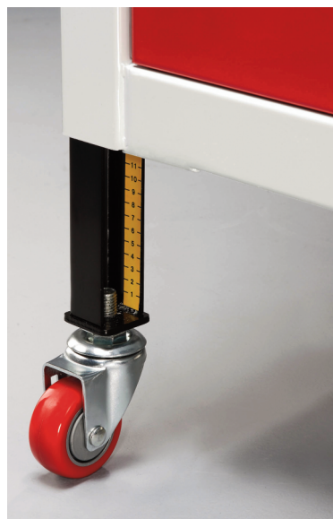
Adjustable table height