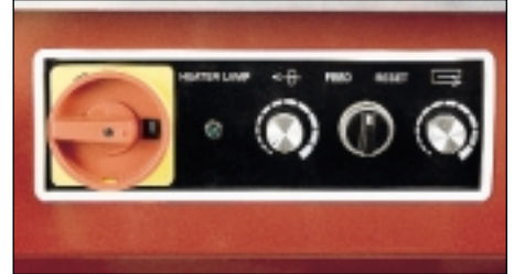
Compact Control Panel