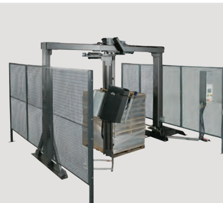
* RTA, RTD & RTC are available with gantry frame and fencing options for enhanced wrap zone protection, high speed applications, and oversized loads.