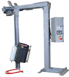
FLEX RTD ROTARY TOWER DELUXE