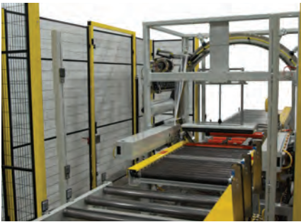
ORBITAL WRAPPING SOLUTIONS

Turntable models turn the pallet load on a turntable while the film carriage moves up and down on a mast. Many customers prefer turntable models for their smaller footprint and easy portability. Turntable drive systems use different support systems, so users must match the weight capacity of the machine (usually 4,000 to 6,000 lbs.) to the maximum load weight that will be processed.