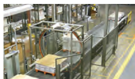
6-Sided Wrapping System