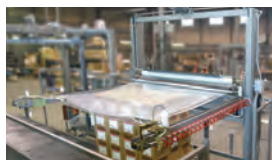
Top Sheet Dispenser (Wrap area model also available)