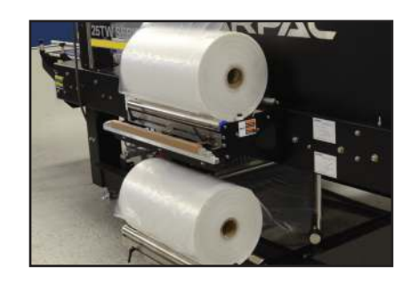
Optional single or dual film cradles