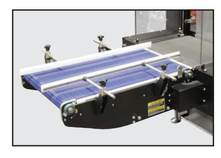
Optional pacing conveyor decelerates product as it enters the infeed conveyor